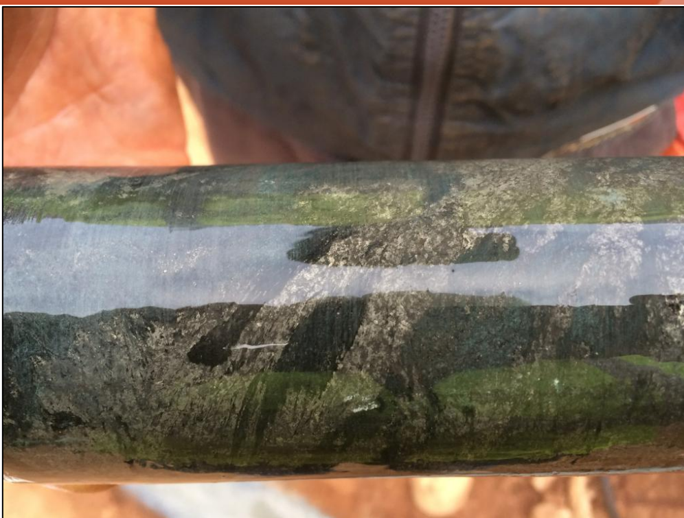
Figure 2: Semi Massive pyrrhotite pentlandite (XRF to 3.15% Ni), KLDH01 93.15 - 93.35m