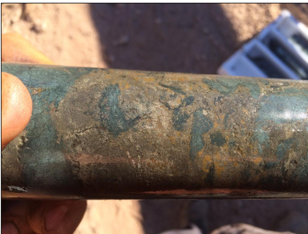
Figure 3: Semi Massive pyrrhotite pentlandite (XRF to 1.75% Ni), KLDH01 137.5 – 137.7m